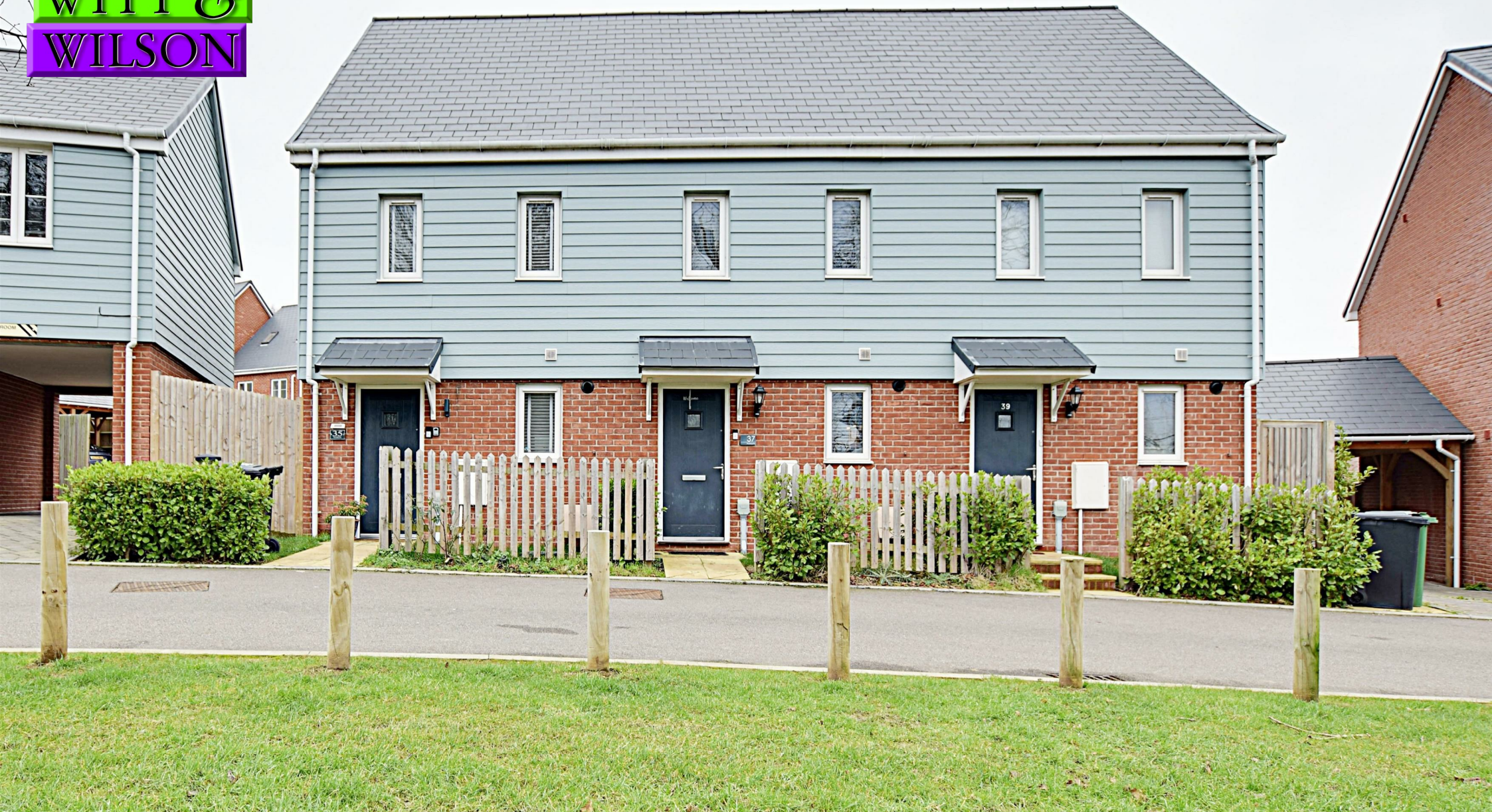
37 Watergate, Bexhill-On-Sea, East Sussex TN39 5ED £299,950